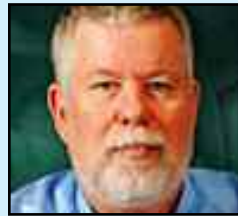
HEWITT - P.16