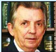
L. KASOWSKI - P.10