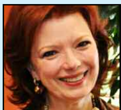
BLANCHARD - P.11

FIND YOUR NEAREST H&R BLOCK TAX SERVICE HOUSTON LOCATION INSIDE ★ 14